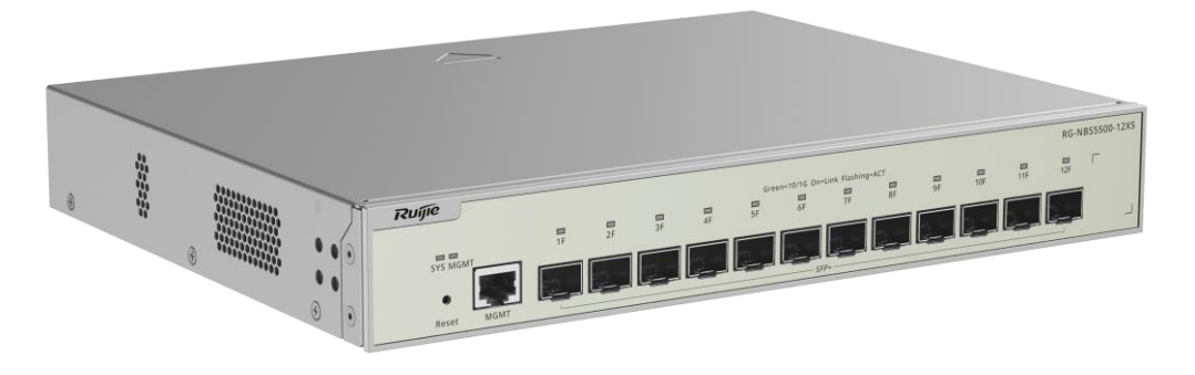
Left View of the RG-NBS5500-12XS