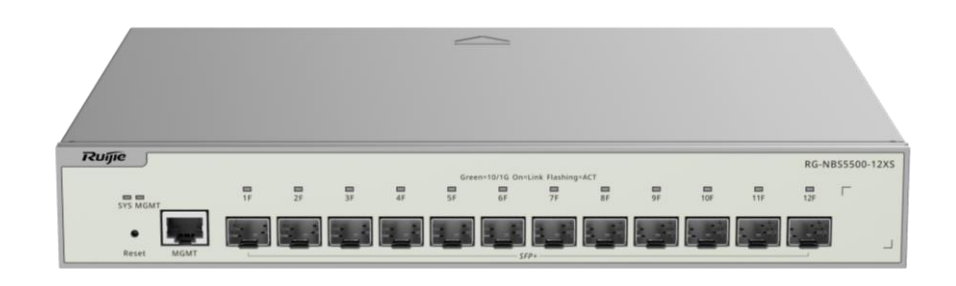
Front View of the RG-NBS5500-12XS