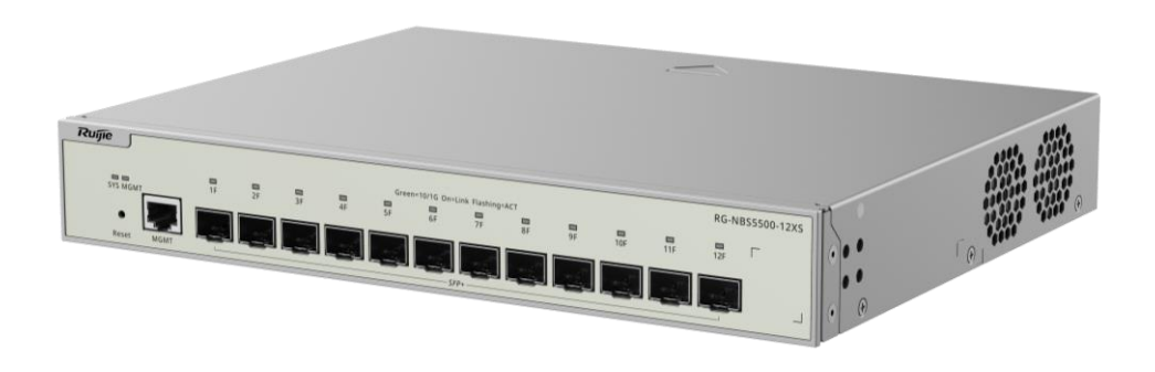
Right View of the RG-NBS5500-12XS