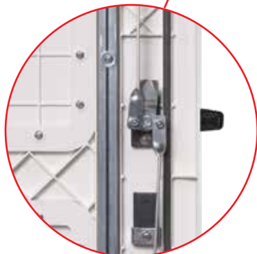
Triple lock system