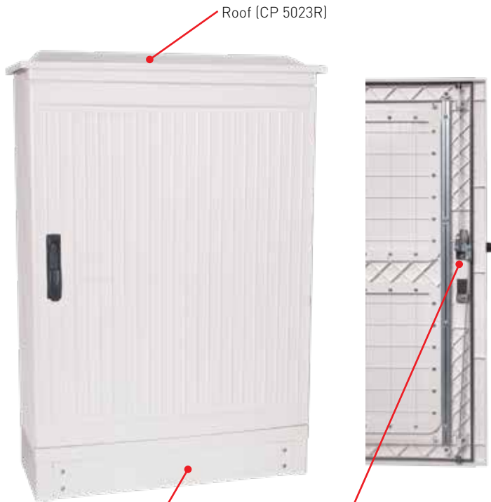
Base (CP 5023B)