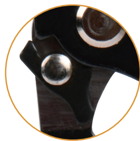
Safety lock design