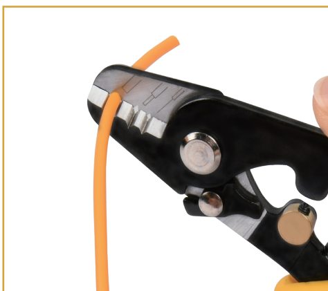
Large hole: strip the outer protective layer of 2~3mm fiber