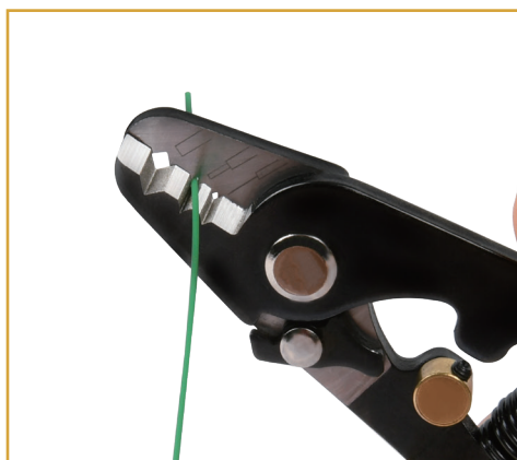
Middle hole: peel off the white soft rubber protective cover of 900 \mu\text{m} ~250 \mu\text{m}