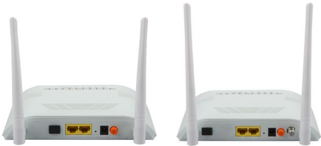
Figure 1 1GE+1FE+WiFi ONU Figure 2 1GE+1FE+WiFi+CATV ONU

xPON 1GE+1FE+WiFi+(CATV optional) ONU meets telecom operators FTTO (office), FTTD (Desk) ,FTTH(Home) broadband speed, SOHO broadband access, video surveillance and other requirements to design an EPON/GPON Gigabit Ethernet products. It is based on mature and stable, cost-effective EPON/GPON technology, high reliability, easy management, configuration flexibility and good quality of service (QoS) guarantees to meet the technical performance of IEEE802.3ah and ITU-TG.984.x , China Telecom EPON/GPON equipment technical requirements and other specifications.